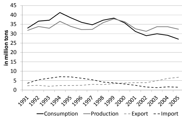
Figure 1: Production and Consumption in the German Cement Industry, 1991-2005 Data source: Verein Deutscher Zementwerke e.V.

Figure 2 describes what was happening in terms of the capacity of German cement manufacturers. The number of plants was reduced quite substantially over time which led to a corresponding reduction in overall oven capacity. Although many closures were of small production plants, the substantial reduction in capacity alongside the relatively constant production volumes in Figure 1 suggest that overall capacity utilization rose, though it is important to keep in mind capacity utilization could have declined in some parts of Germany. While small plants were being shuttered, at the same time most large cement companies were either modernizing existing plants or replaced several old plants with the construction of a new larger plant.